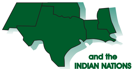
and the INDIAN NATIONS